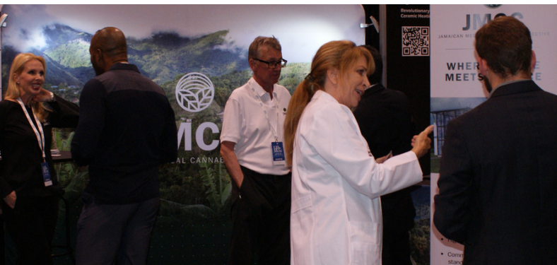
JMCC employees at LIFT 2017

Overall, the Expo provided great opportunities to meet and learn for those in the medical cannabis industry, as well as current patients and the general public. A definite buzz was in the air and, despite the many challenges our young industry